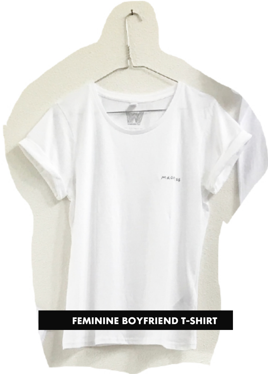
FEMININE BOYFRIEND T-SHIRT

Washinstructions: • Machine washable (max 30 C) • Wash and iron inside out • Do not tumble dry • No ironing on print