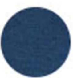
mid washed indigo

Measurements: Chest wide: 48 cm (S) - 51 cm (M) - 54 cm (L) - 57 cm (XL) Front length: 64 cm (S) - 66 cm (M) - 68 cm (L) - 69 cm (XL) Sleeve length: 71 cm (S) - 72,5 cm (M) - 73,75 cm (L) - 75 cm (XL)