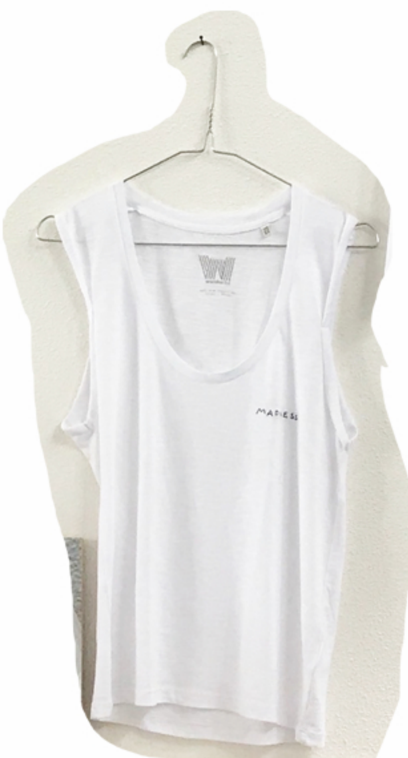
SLUB TANK TOP

Sizes: XS \ S \ M We recommend to order your regular size for a cool, loose fit Features: Rolled up sleeveless tank top \ deep round neck \ very loose fit Material: 100% organic combed cotton jersey Colours: white / 120 gr.