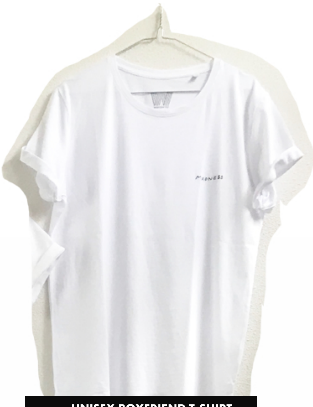
UNISEX BOYFRIEND T-SHIRT

Washinstructions: • Machine washable (max 30 C) • Wash and iron inside out • Do not tumble dry • No ironing on print